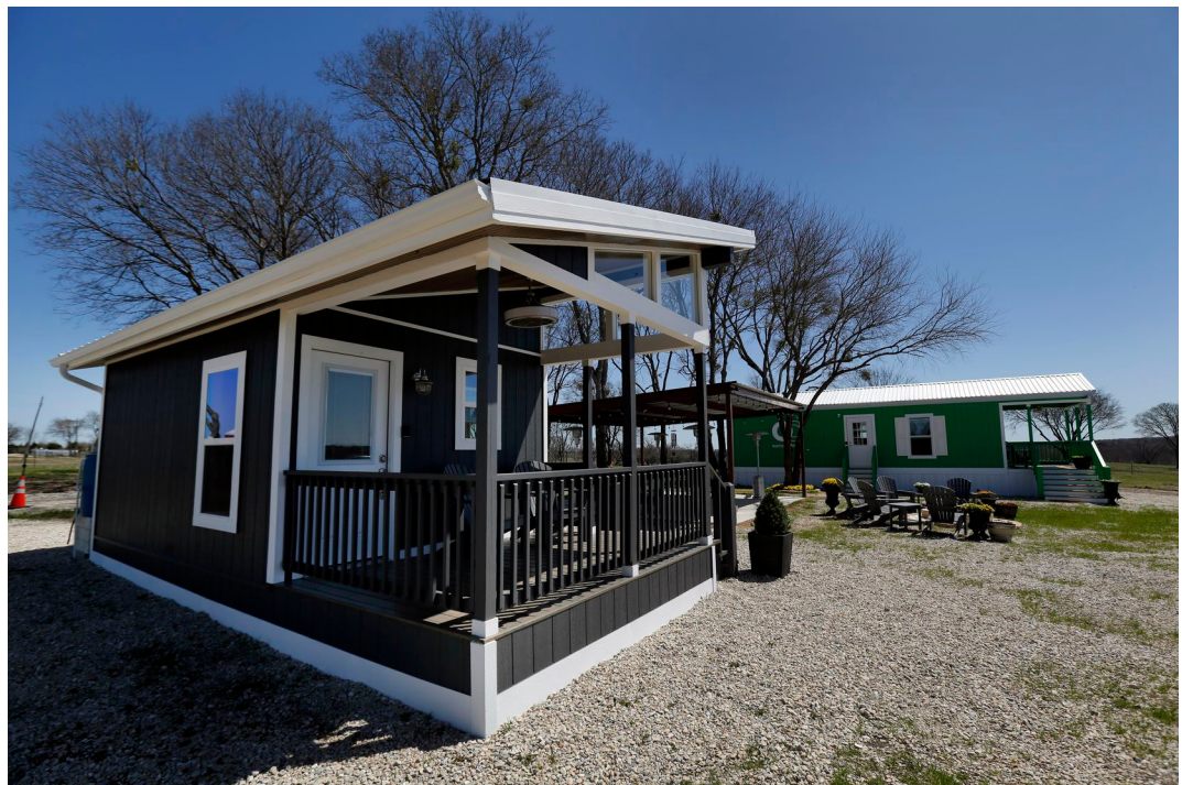
An exterior view of tiny house models at OurCommunity, which is under construction in rural Ellis County, Texas, March 25, 2022. OurCalling -- a faith-based, nonprofit service provider for people experiencing homelessness in Dallas -- is building a village for the area's most needy who have complex medical needs and need permanent supportive housing. Named OurCommunity, the village of tiny homes and support services will span hundreds of acres in unincorporated Ellis County, about 20 miles south of downtown Dallas.